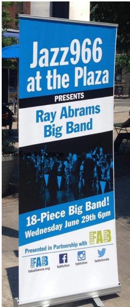
2016 Event Signage