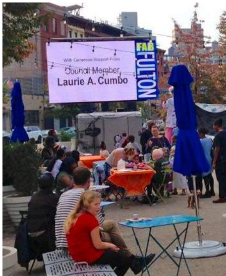
Sponsors On Big Screen